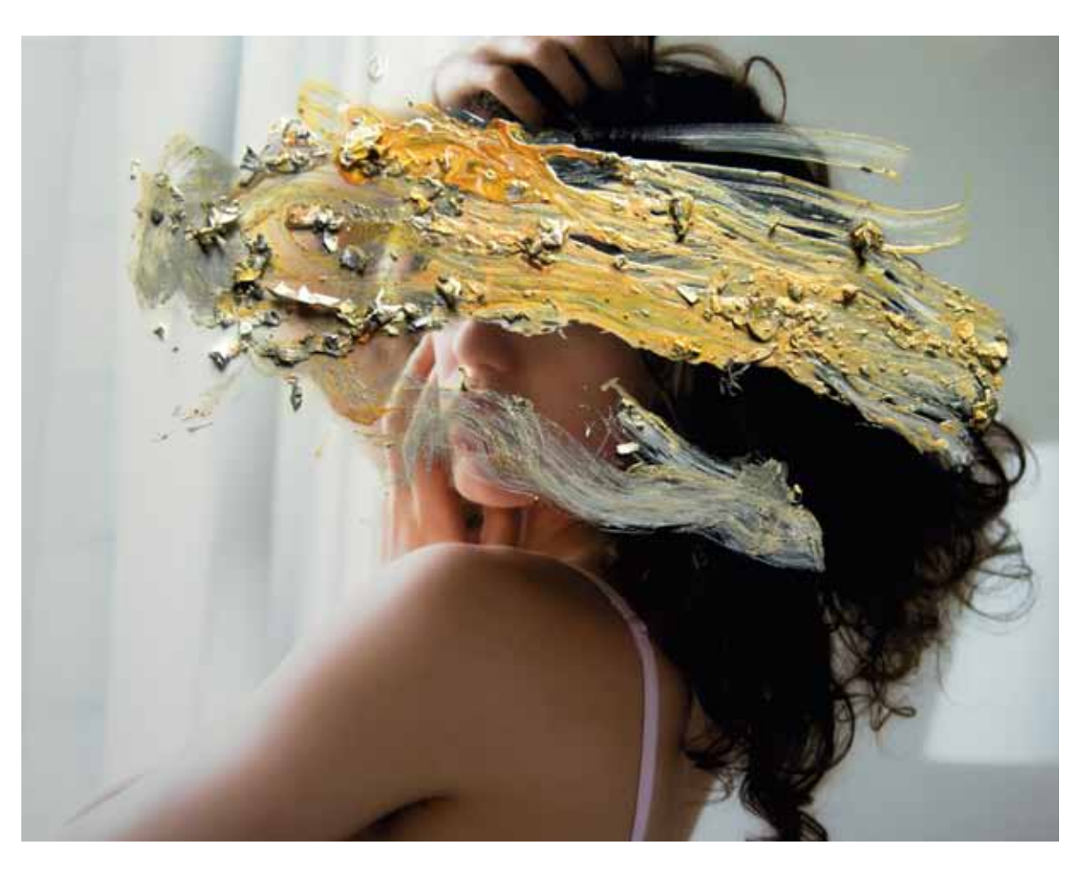
It's So VR Outside, 2015.