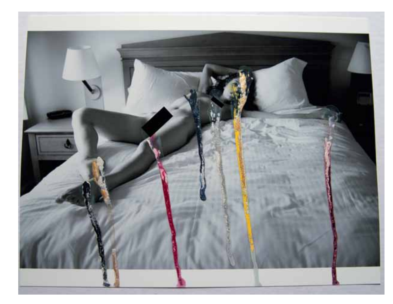
Snow White and the Seven Unsafe Landings, 2015.

Is there a mantra that you live by or feel best summarises your practice? A mantra I've come to adopt is "go where you're wanted", which is hard because sometimes you don't know whether you should push to get somewhere you're not wanted or just move to where you're wanted. But inevitably it's something that has stuck with me. Specifically, I didn't have the body of a model, my hips were too big, and I was sad not to be welcomed into the modelling industry when I was young. But then Instagram came along where bigger hips are welcome. So, in a way it's the same thing as "be who you are" and, really, be into who you are even if it seems you're the only one. Also, if you have goals, you just have to go hard and work at them every day.